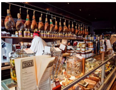
Salumeria Rosi is one of New York City's favorite Italian spots.