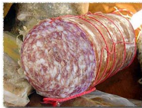
Finocchiona is a real Tuscan treat.