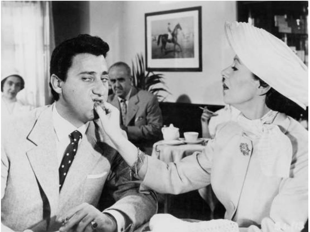
I ragazzi di via Panza (1951) Directed by Antonio Pietrangeli Music: Alberto Tomba (as Sergio)

Photos: good over time. EDITORIAL, use only unless otherwise registered. Please inform us about usage or coverage in order as possible. Research fees may apply for images at need.