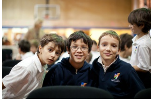
La Scuola offers classes from the Preschool level through Liceo (high school).